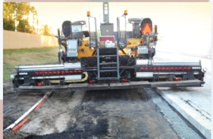
A paving screed designed for paving wider roads and surfaces uses a Gortrac SX Series carrier to guide the power cables as the slide track telescopes to the required width.