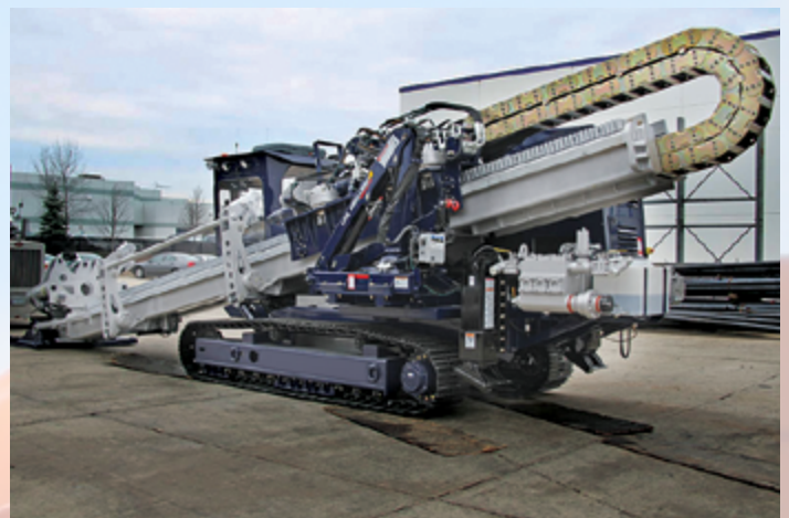
Nested Gortrac SRC Series carriers protect and guide hoses on this horizontal directional drilling machine by Universal HDD™.