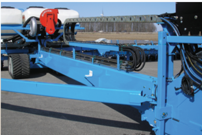
A steel Gortrac LRC Series carrier was customized for increased box strength to handle the vibration experienced by the carrier during operation. This planter with 88-foot wide extension allows greater coverage with fewer passes.